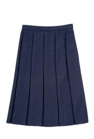
Plain navy pleat skirt