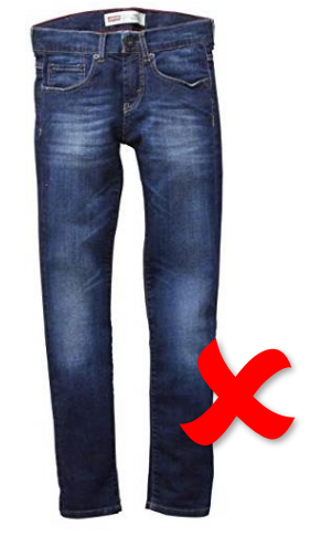
Jeans; short-shorts; jean-shorts