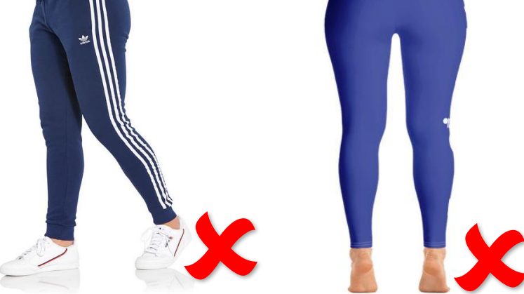
Track pants with clear design elements/logo -- Leggings/activewear. Any non-navy pant