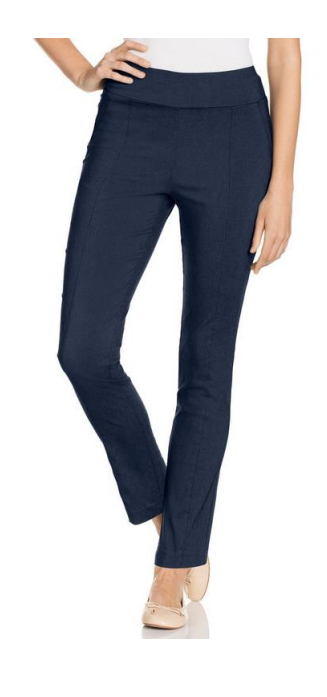
Dress pant, navy (bengaline for stretch)