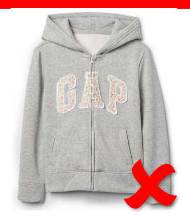
Winter layers in non-school colour; clear logo or design elements