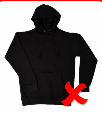
Black hoodie – only navy and white permitted, UNDER school polo