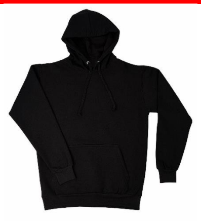
Black hoodie – only navy and white permitted, UNDER school polo