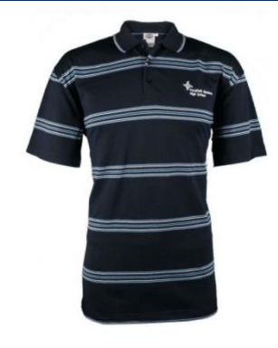
Polo Shirt with Logo