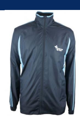
Track Jacket with Logo