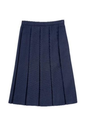
Plain navy pleat skirt