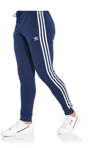
Track pants with clear design elements/logo -- Leggings/activewear. Any non-navy pant