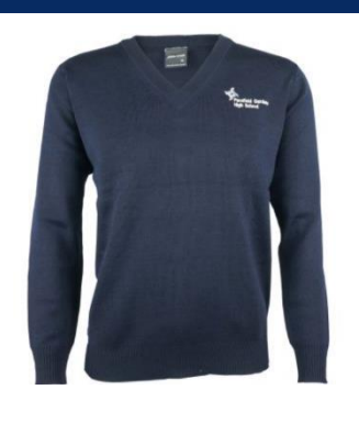
Jumper with Logo (Knitted)