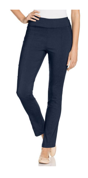
Dress pant, navy (bengaline for stretch)