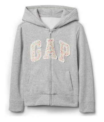
Winter layers in non-school colour; clear logo or design elements